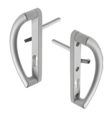
BSC94 - Inline Sliding Door D Handle