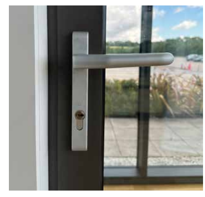
BSC94 - Lift & Slide Door Handle

Of course, added strength and security should never compromise style. And certainly never function. It's why our hardware products not only improve ease of operation for years to come, but deliver a timeless look and finish.