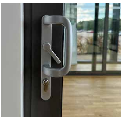
BSC94 - Inline Sliding Door Handle